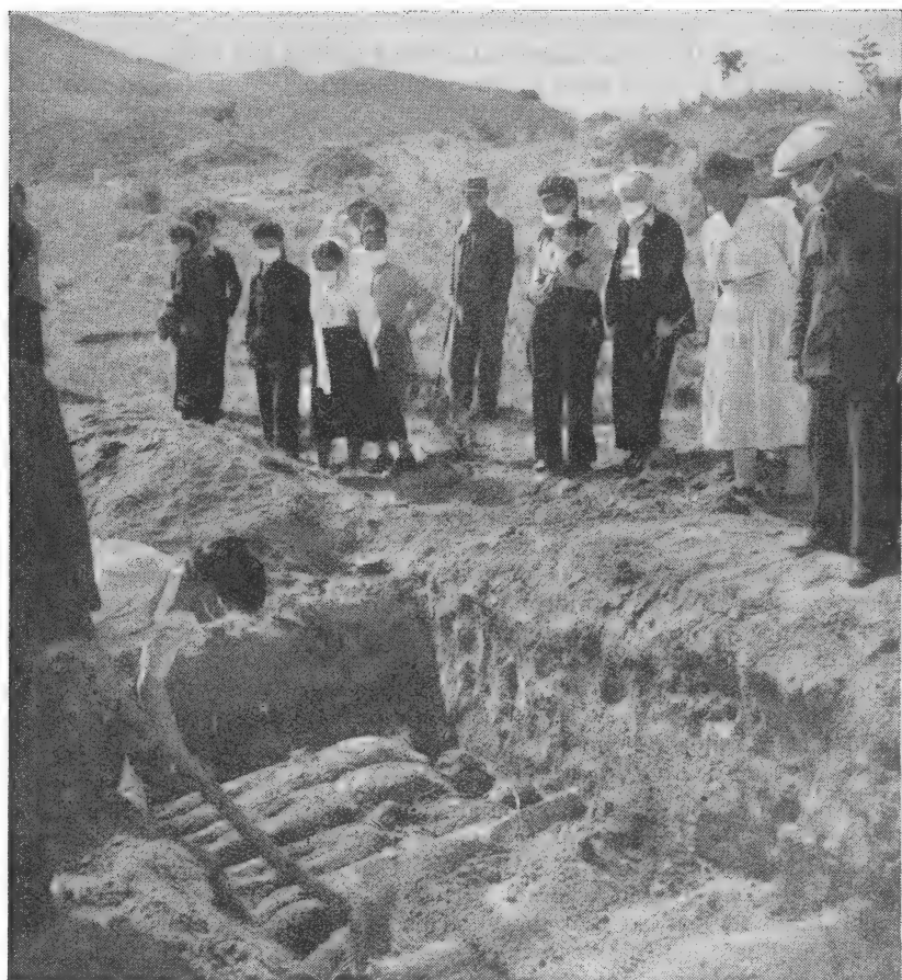
A mass grave is opened for the Commission at Anak